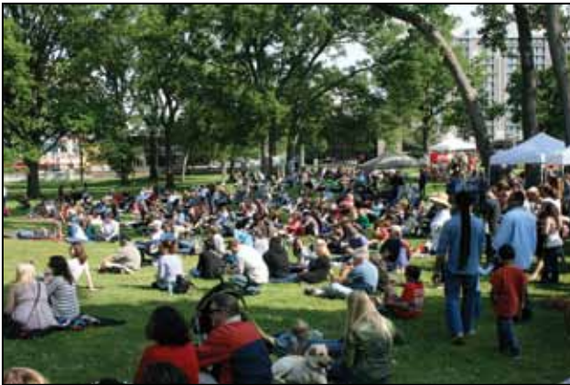
The crowd for this season's first Musicians Corner was great!